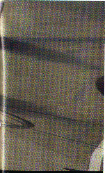
All drivers in the ASCAR stock car championship will have to undergo advanced rookie tests next week